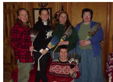
Students from the Winter Class

Creative Class ... In this class, students will work ,using their own feathers, to design a special creation with Zoe's expert guidance. (limit - 4 students)