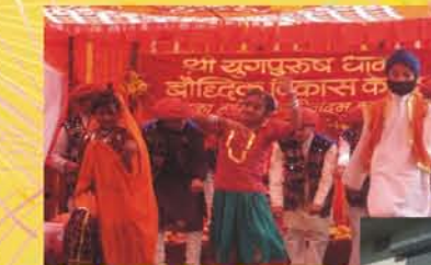
Mentally and physically challenged children perform traditional Hindu songs and dances.