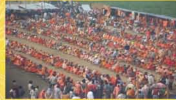
Feeding Saints in APD MawieDham Ashram