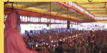
Thousands gather for Satsang