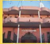
Akhand Paramdham Head Office And Ashram in Dehli

40 APD spiritual community ashrams have been established where saints and serious spiritual seekers are provided refuge amidst the sacred grounds of devotional temples throughout India and abroad.