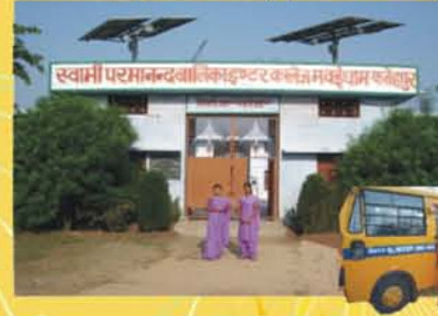
Swami Paramanand Balika Inner College, Mawie Dham, Fatepur, U.P

Many schools have been established in remote areas of Northern India which provide education to thousands of children who otherwise would have no opportunity to even learn to read and write. In 2006, a degree college opened for the continuing education for these previously disadvantaged children.