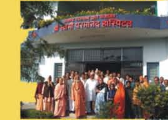
Swami Paramanand Hospital, Panchkuian Indore, M.P.

Akhand Paramdham has opened 9 hospitals with modern facilities, providing ayurvedic as well as homeopathic treatment at low or no cost. Thousands of people are now being helped on any given day. More than 50 professional doctors and nurses who are devotees of Swami ji consider it an honor to provide their services to humanity.