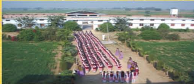
Swami Paramanand Girls Degree College

APD has established 16 schools and colleges in remote areas of India, providing classrooms, transport, room and board for needy children.