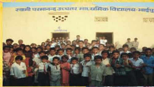
Swami Paramanand Ji High School in the small village of Bhaipur, U.P.