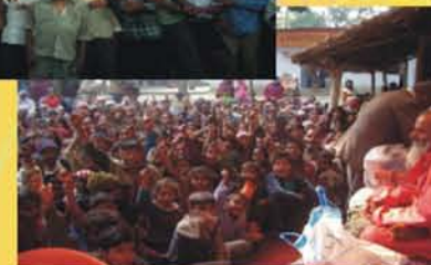
Shri Swami Paramanand School in the small village of Kumaria Shukla, U.P.