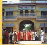
Chitrakoot APD in M.P.