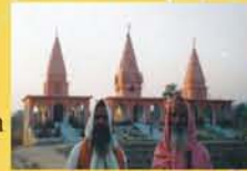
Temple at APD Ashram in Naunath, Jammu Kashmir