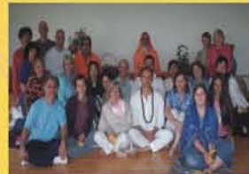
Paramanand Yoga & Vedant Institute, NY, USA is a NPO 501C3. www.paramyoga.org