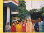
Amritsar APD Ashram