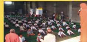
Children's meditation class