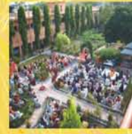
Haridwar APD Main Ashram