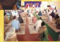
Foreigners attend yoga class in Haridwar, India